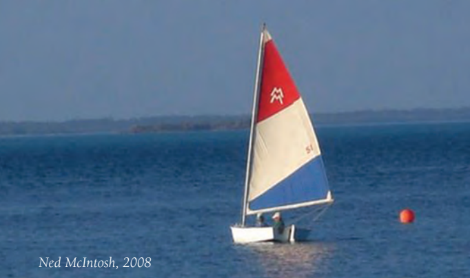
Ned McIntosh, 2008